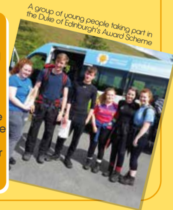
A group of young people taking part in the Duke of Edinburgh's Award Scheme